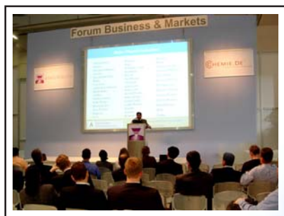
Analytica Munich 2008