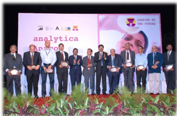
IAIA Life Time Achievement Awardees Analytica Anacon 2007

On the eve of celebrations regarding the “Decade of Service of IAIA” last year, the association decided to recognise the contributions of veterans in analytical instrument industry in India by giving Life time achievement awards under three categories - Manufacturers, distributors and professionals whose dedicated efforts for decades have contributed to the development of markets for new technologies. Thus the “Indian Analytical industry- Hall of Fame 2007” was born with with ten experts being adorned with the coveted awards.