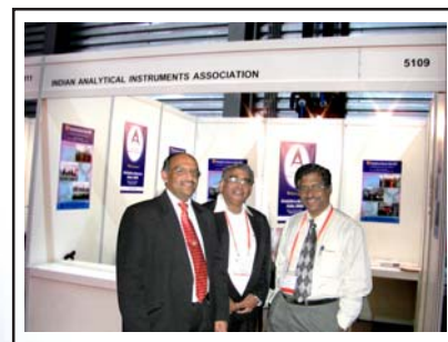
Analytica China 2008