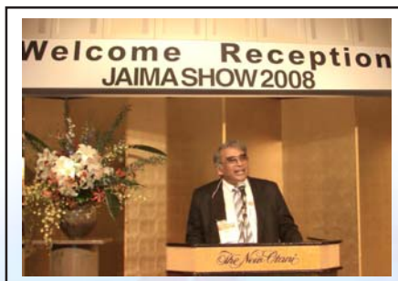
Jaima Show 2008